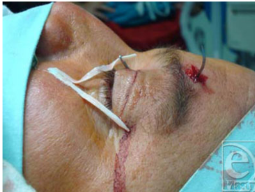
Figure 2. Tensor fascia lata is to be tunneled via needle.