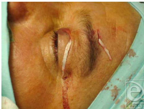
Figure 3. Tensor fascia lata tunneled, ready to be tethered.