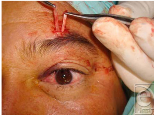
Figure 4. Simulation of suspension via tensor fascia lata.